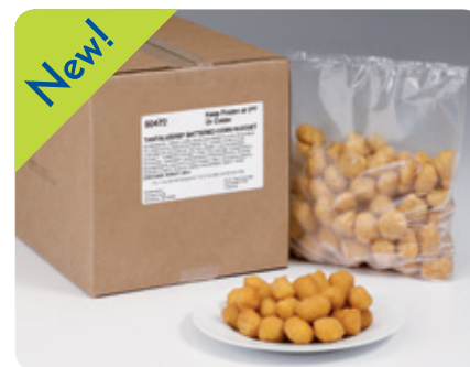
50472 – Larger pack for operator convenience