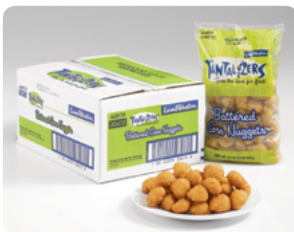
30472 – Smaller pack size for limited freezer space

A blend of sweet yellow corn and a rich, slightly sweet sauce – rolled in a golden, crisp batter for a delicious corn flavor!