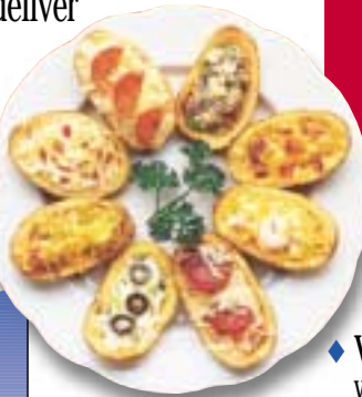
Western Bacon BBQ Fries