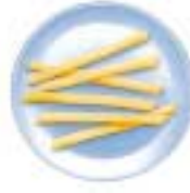
Higher Quality/XLF Grade Better plate coverage, 108 servings per 27 pound case.