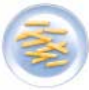
Lower Quality/FA Grade Less plate coverage, 94 servings per 27 pound case.